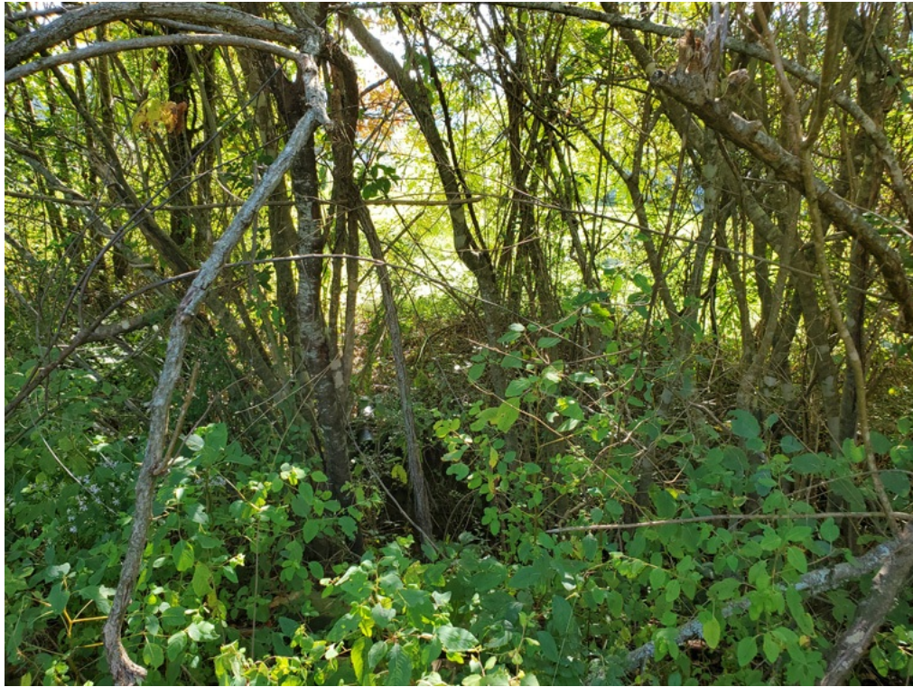
Here is the (buried) culvert poking out of the ground, well into the creek area. It appears to be black plastic culvert pipe, about 12" diameter, I would guess.