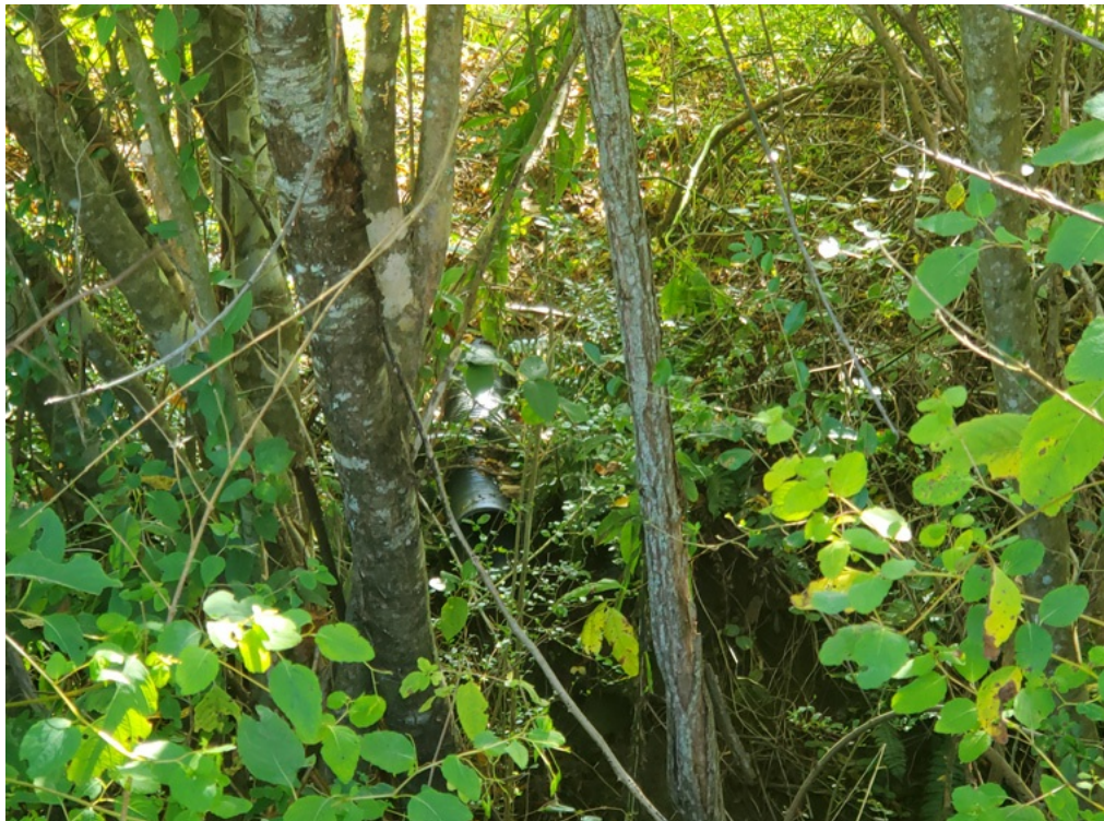
Here is a tighter shot.