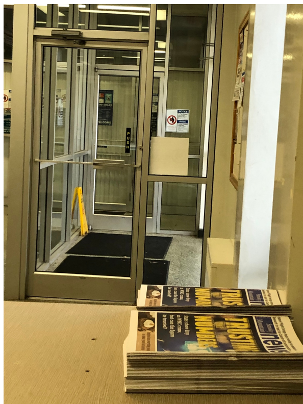
Inside Main Waynesville Post Office

How long does anyone think this practice will continue?