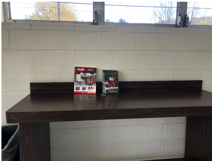
Inside Hazelwood Post Office Today