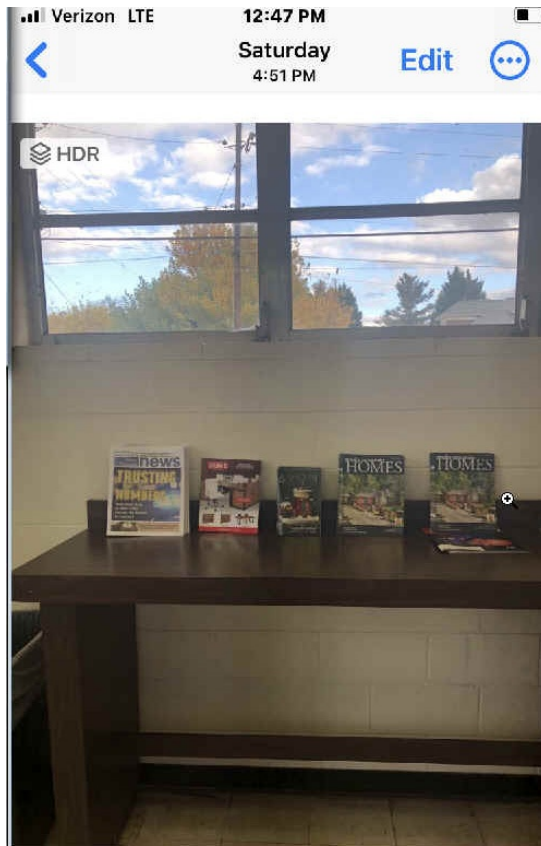
Inside Hazelwood Post Office Saturday