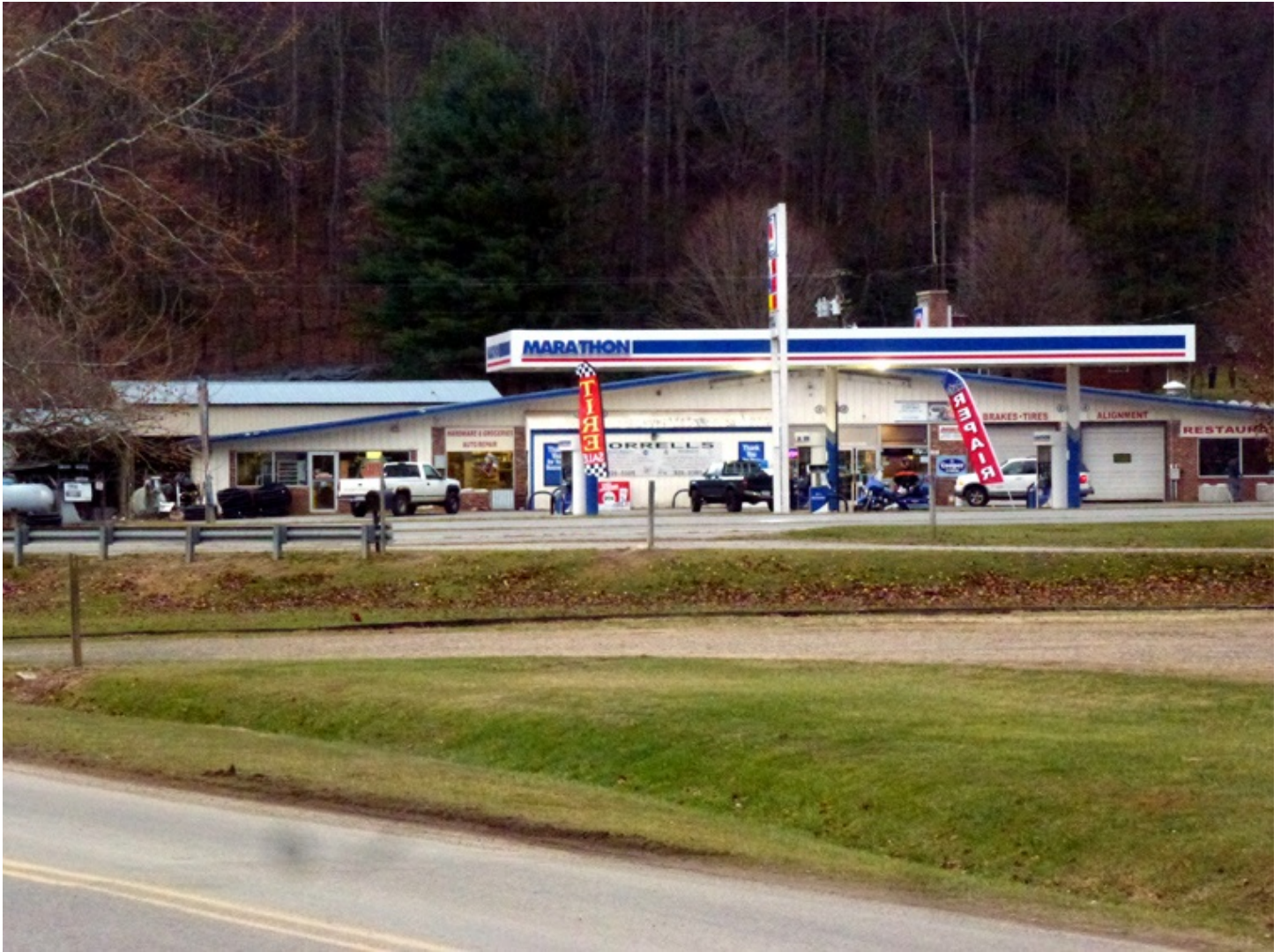
Zoom shot of the gas station. Visible is "orrells" on a sign in front of the gas station.