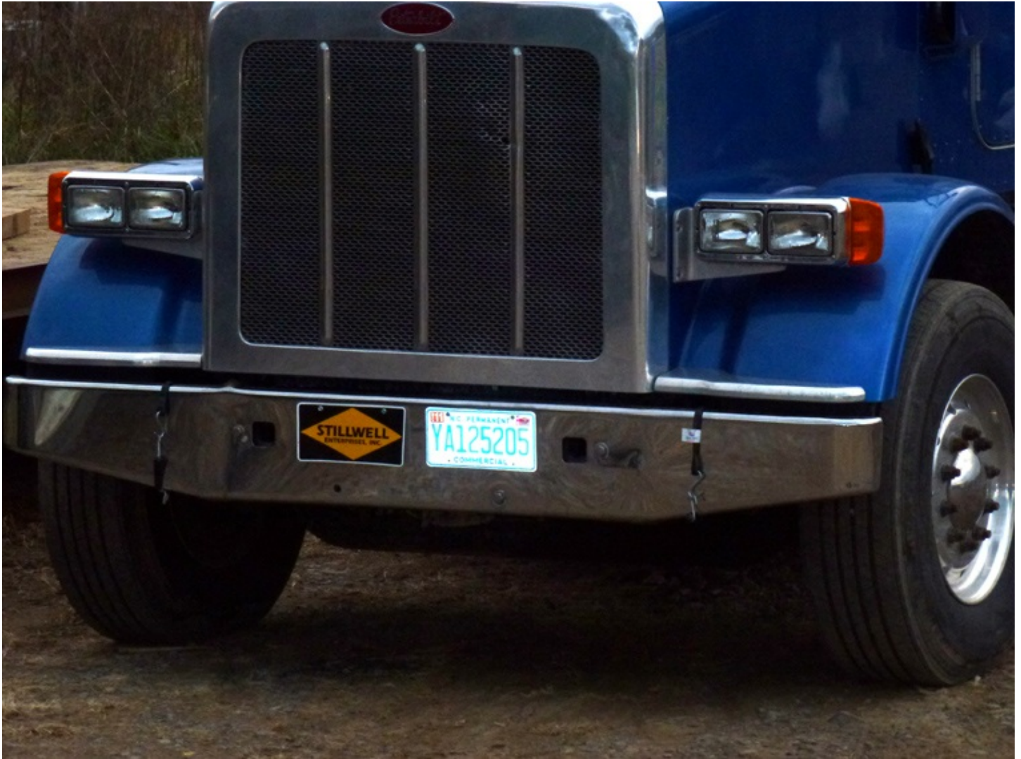
This is a close up of the blue tractor trailer, indicating it belongs to Stillwell Enterprises, Inc., License NC Permanent YA125205 Commercial.