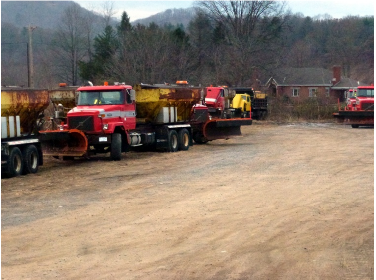
Starting sweeping counter-clockwise, this is a zoom shot of some of the equipment. Looks like snow plowing / removal equipment.