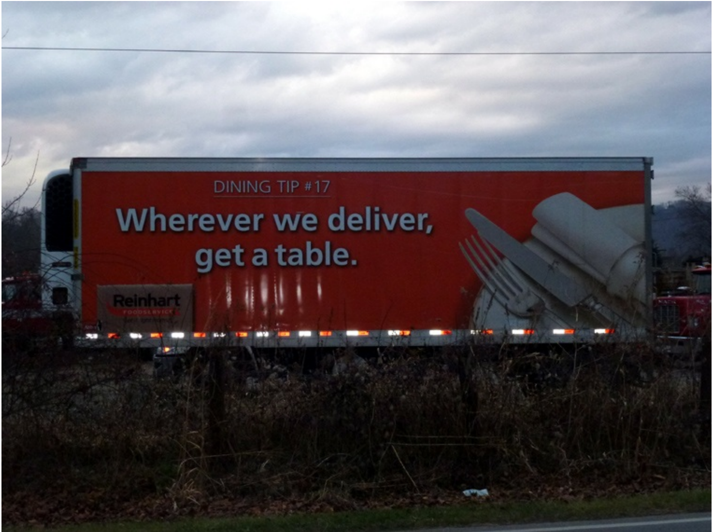
Zoom photo of one of the companies on 8606-68-0685, Reinhart Food Service.