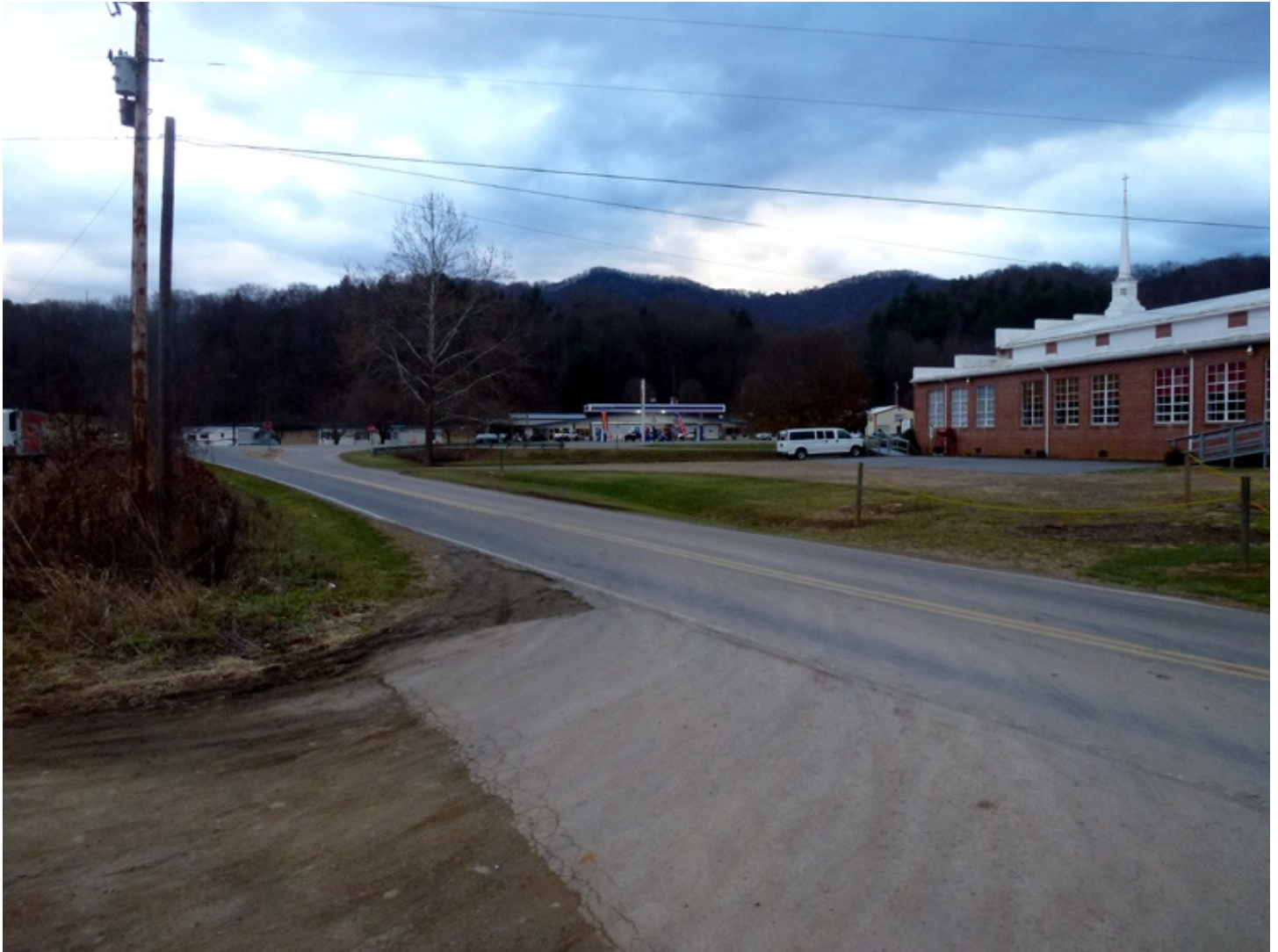
Continuing clockwise, this shows the street in front of the property, a church across the street, and Michael Sorrells gas station across 276.