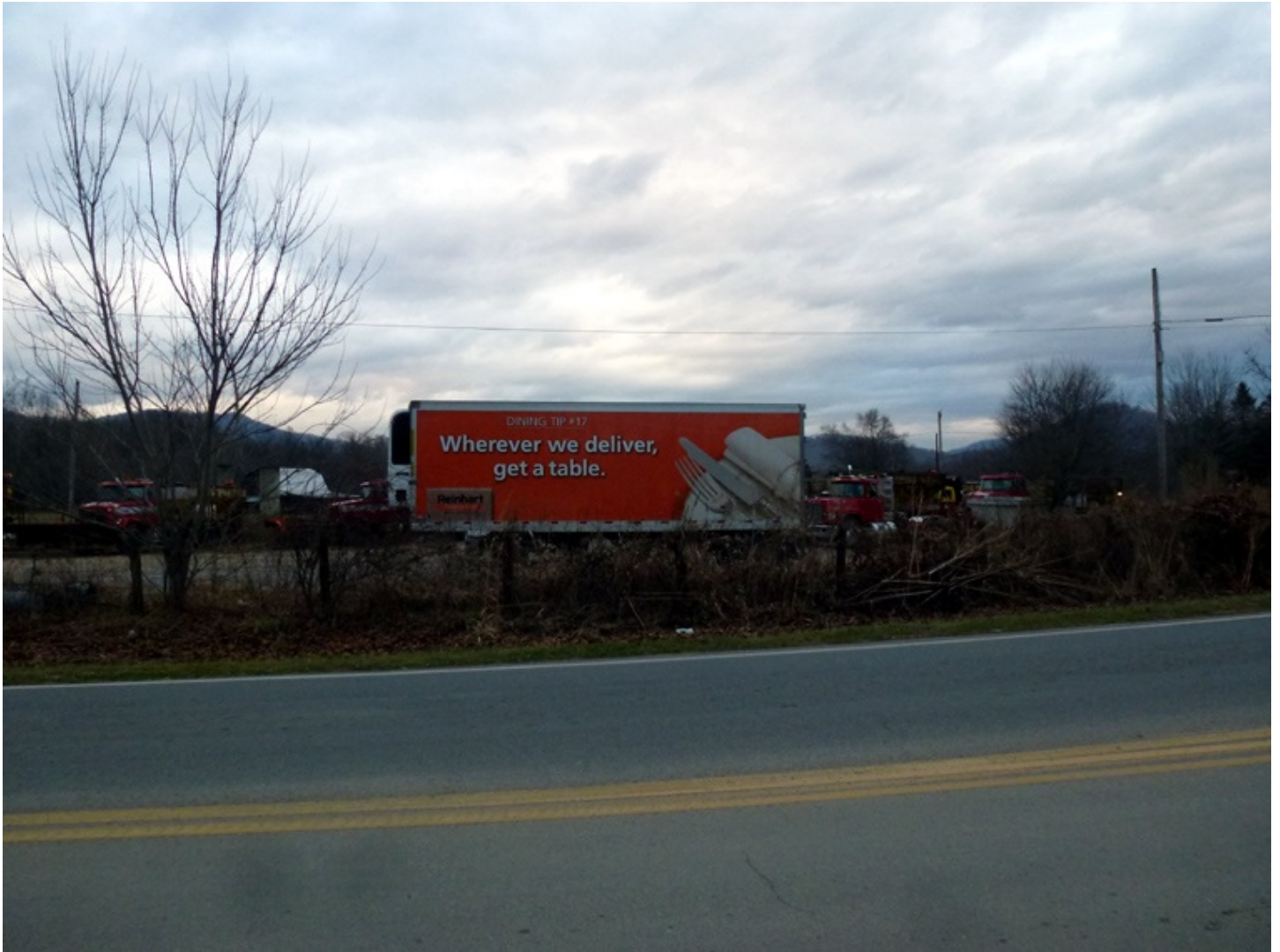
From across the street, broader photo of equipment on 8606-68-0685.