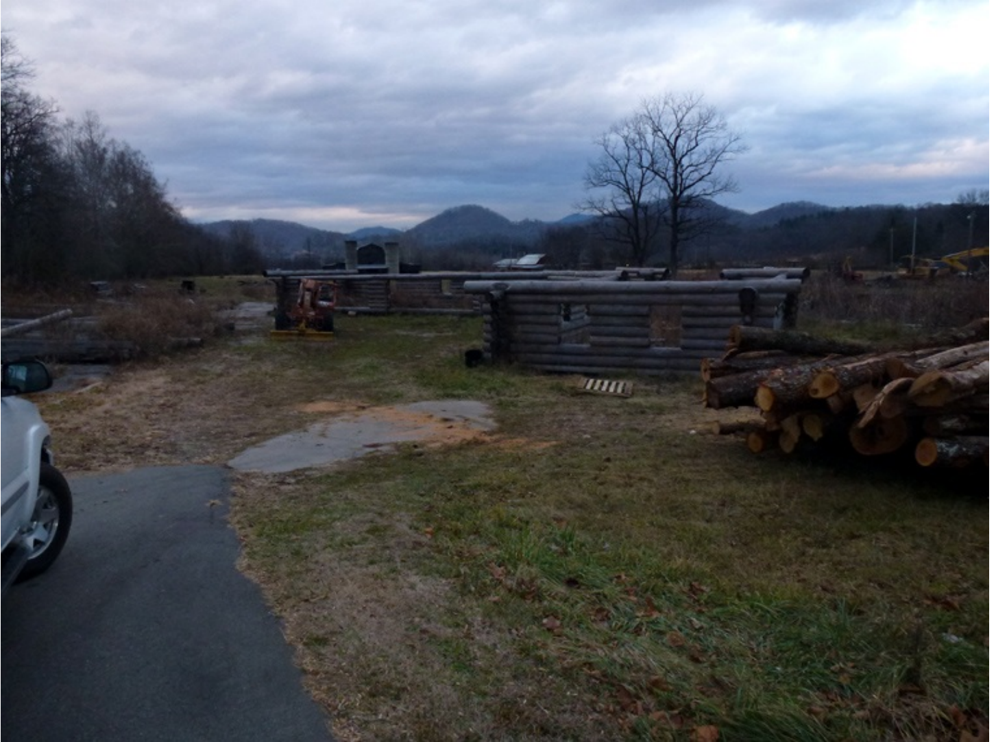
A whole little village of log cabin model homes. There is some machinery parked in front of the models. Off in the distance is the barn, for this land designated as farmland.