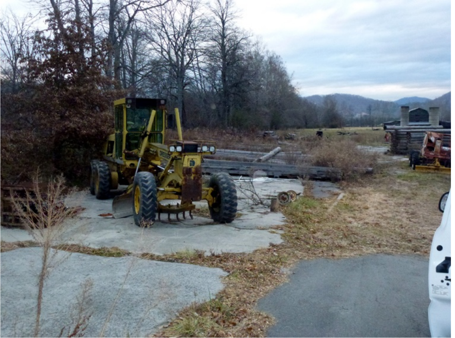
A large tractor, pallets, logs and building supplies.